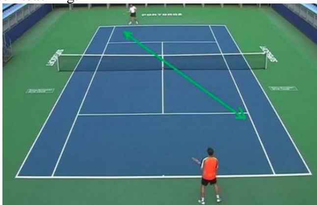
Fig.1 Badminton new teaching mode

The teaching mode is rigid and the teaching method is single, which is a common problem in college badminton teaching. For a long time, many teachers have been teaching and demonstrating in badminton teaching. The new curriculum standards for physical education in colleges and universities require that PE teaching in colleges should be people-oriented, student-centered, follow the law of student development, improve students' enthusiasm and participation, and promote the healthy development of students' personality [7]. This requires universities to innovate badminton teaching and training techniques in badminton teaching to promote the continuous development and improvement of badminton teaching.